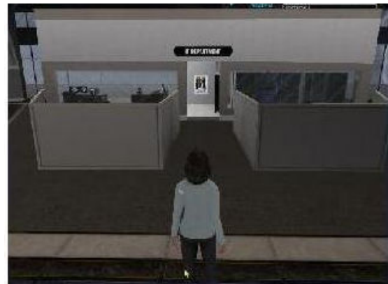
Figure 1e: Office-Information Technology