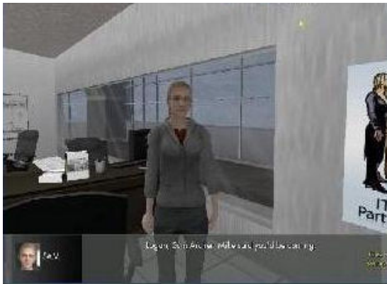
Figure 1g: Office-Information Technology