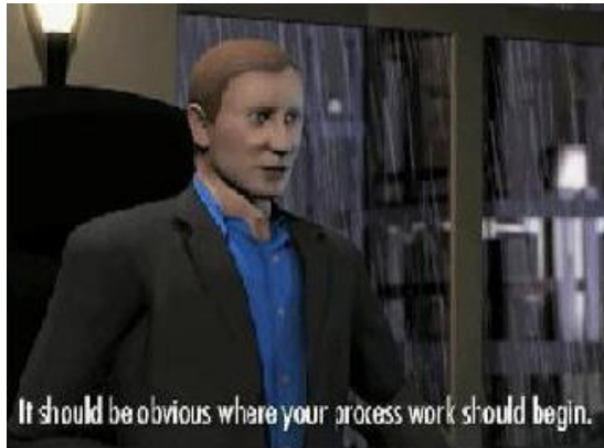
Figure 1a: Manager-Office Personality