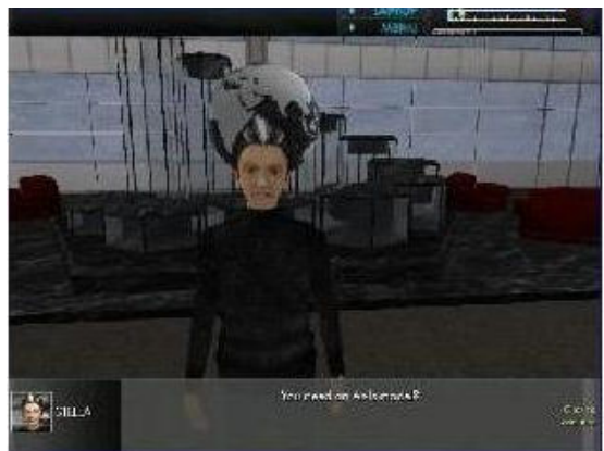
Figure 1f: Office-Information Technology