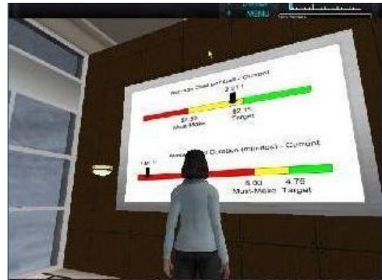
Figure 1i: Planning Process