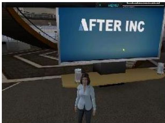
Figure 1c: Consultant-Office Personality