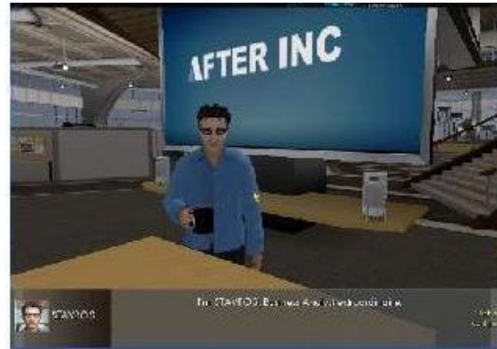
Figure 1d: Office