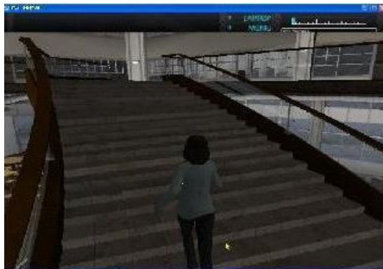
Figure 1b: Consultant-Office Personality